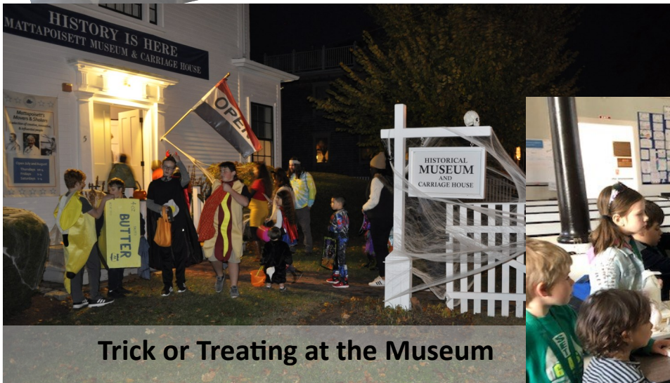
Trick or Treating at the Museum