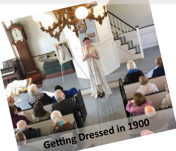
Getting Dressed in 1900