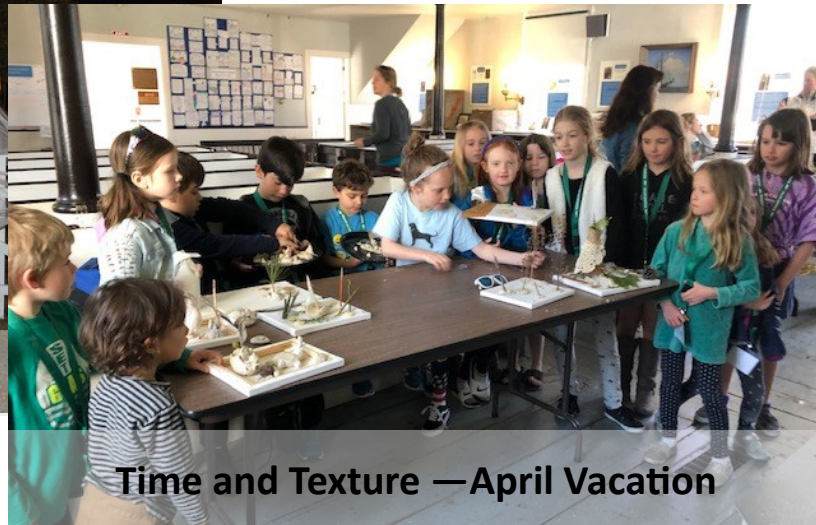
Time and Texture — April Vacation